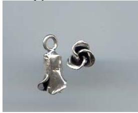
NS 179 1.6 gr