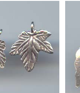
NS 196 3 gr