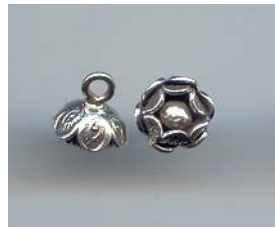
NS 176 2 gr