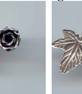
NS 195 3 gr