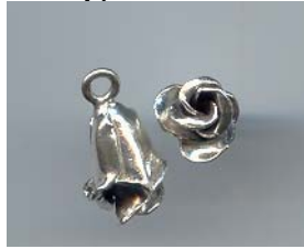
NS 180 3 gr