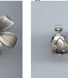
NS 194 3 gr