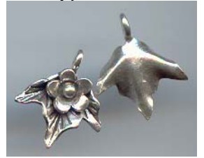
NS 182 1.7 gr