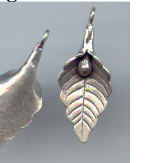
NS 197 3 gr