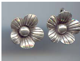
NS 188 1.5 gr