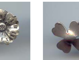
NS 190 2.8 gr