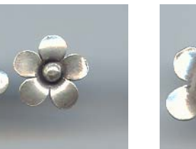
NS 186 2.5 gr