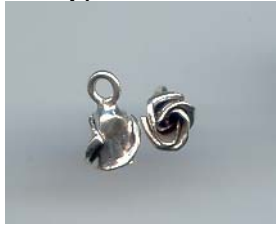
NS 178 1.3 gr