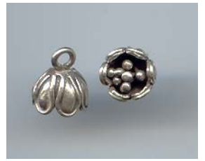
NS 177 2.2 gr