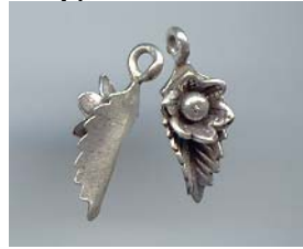
NS 181 1.6 gr