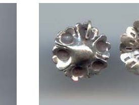
NS 189 2 gr