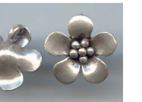
NS 187 1.7 gr