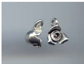
NS 183 1 gr