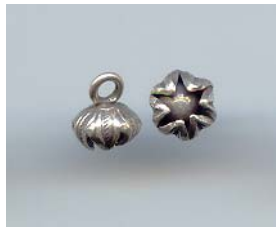
NS 175 1.8 gr