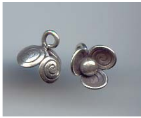
NS 174 1.8 gr