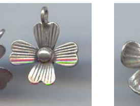
NS 191 3 gr