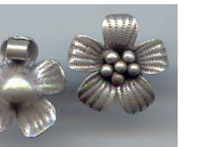
NS 192 3.5 gr