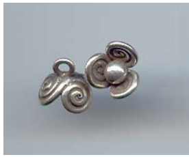
NS 173 1.8 gr